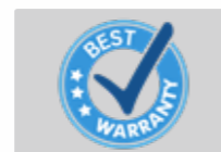
BEST WARRANTY IN THE INDUSTRY